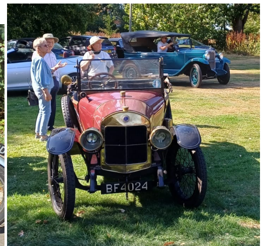
also seen at wren Hall